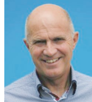
MEL CASSEY CHAIR